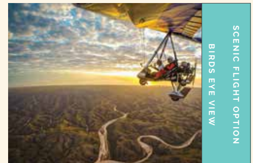
SCENIC FLIGHT OPTION BIRDS EYE VIEW