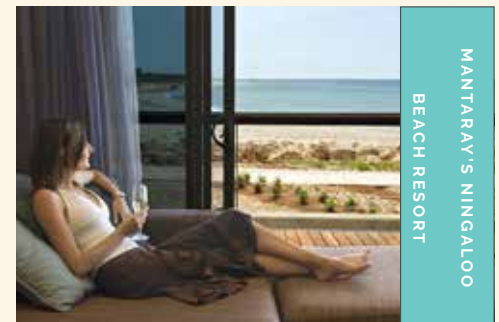
MANTARAY'S NINGALOO BEACH RESORT