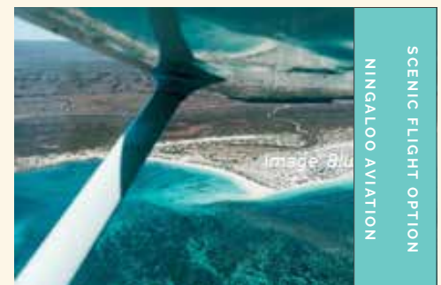
SCENIC FLIGHT OPTION NINGALOO AVIATION