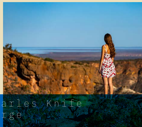
Charles Knife Gorge