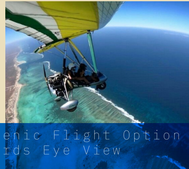
Scenic Flight Option Birds Eye View