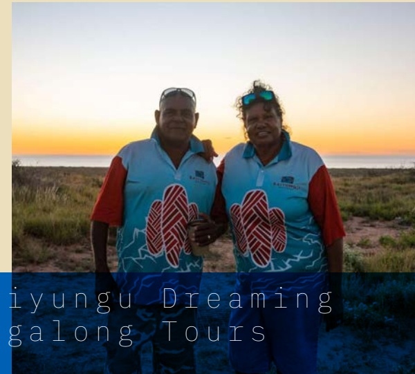
Baiyungu Dreaming Tagalong Tours