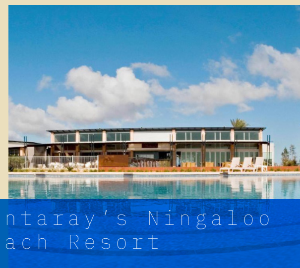
Mantaray's Ningaloo Beach Resort