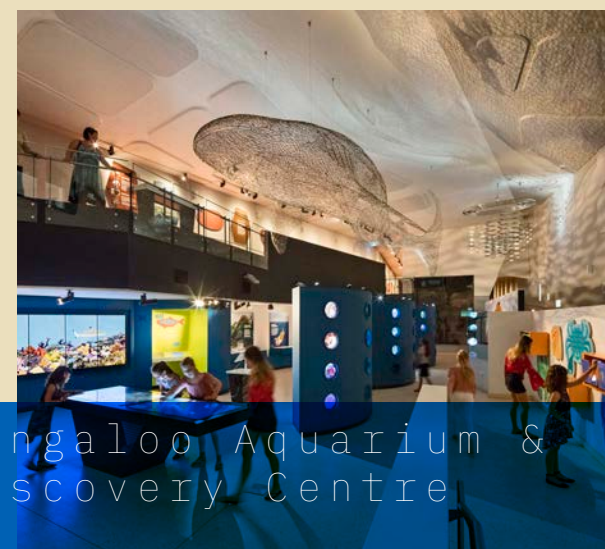
Ningaloo Aquarium & Discovery Centre