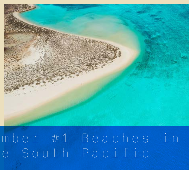
Number #1 Beaches in the South Pacific