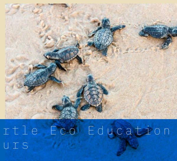
Turtle Eco Education Tours

Play your part in the conservation of marine turtles when you join a Jurabi Turtle Centre Turtle Nesting and Hatchling Tour. Join an eco-guide for the best chance to view turtle nesting activity in December and January and turtle hatchlings in February and March. There's nothing quite like watching the tiny hatchlings emerge from their nest and make their way to the ocean to start their long journey to adulthood.