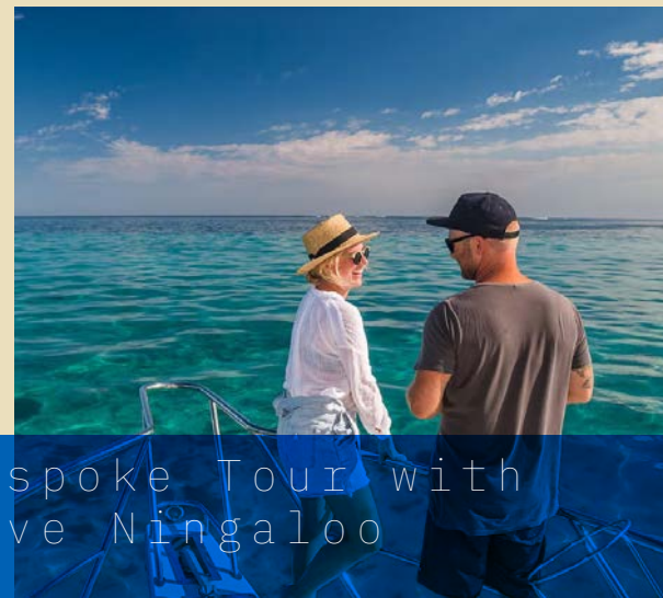
Bespoke Tour with Live Ningaloo