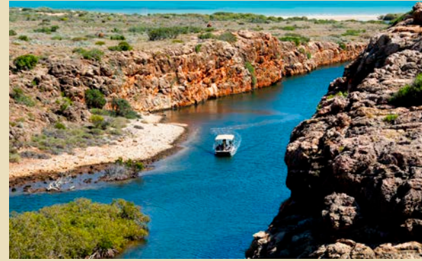
Yardie Creek Boat Tour