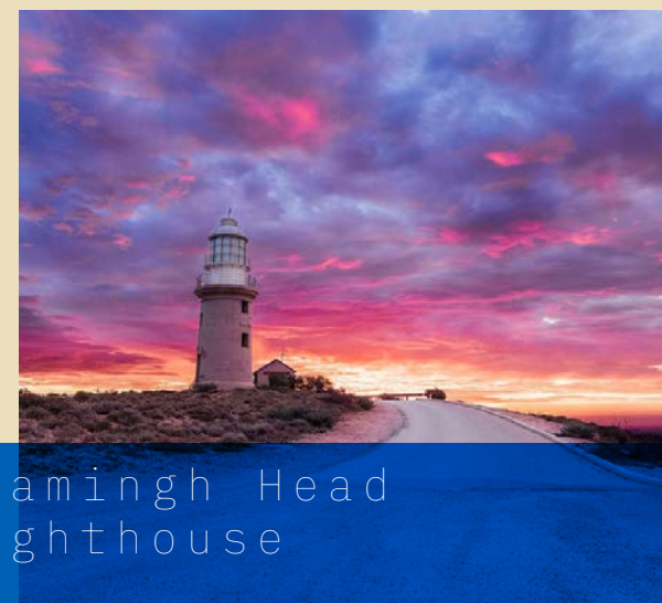
Vlamingh Head Lighthouse

Travel to Vlamingh Head Lighthouse and pick the perfect spot to watch the sunset as you enjoy your Cafe Muiron gourmet hamper.