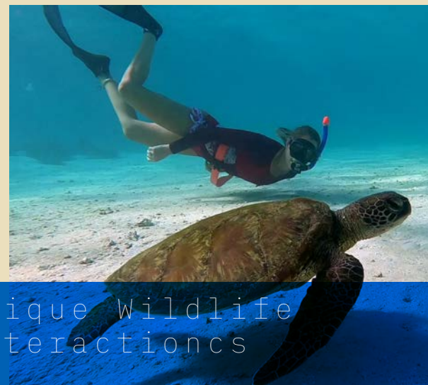
Unique Wildlife Interactions